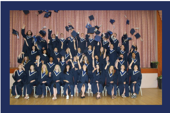
MCI Class of 2022