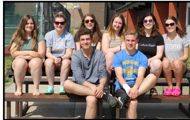
Student Council Executive 2018-19

Student council elections for 2019-20 will take place in September with voting on September 18th.