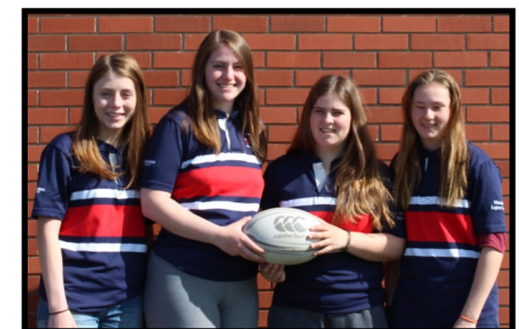
Our 4 MCI Members of the Girls Rugby Provincial Champs: 3-peated!

We had another successful year for MCI Athletics by winning numerous Zone events and sending over 40 athletes to provincial competitions throughout the province. Some of the highlights include: Girls Soccer, Girls Volleyball, Girls Rugby (Champs for 3rd in a row), and multiple individual athletes at Golf, Cross-Country, Badminton and Track and Field Provincials respectively. Our Chancellor Hockey team brought home the League banner on the consolation side.